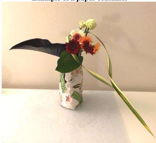
Example of a paper container

Masae has asked that you bring the following to create your paper container in the workshop: